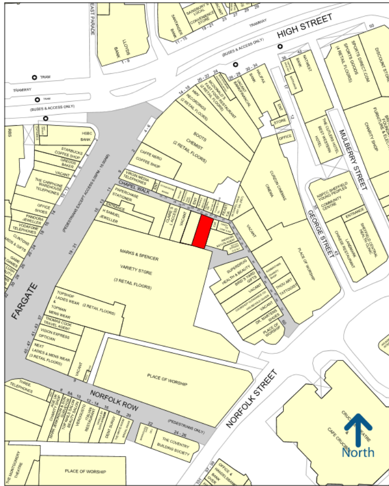
Experian Coad Plan Created: 20/04/2016 Created By: Paul Lancaster CPC