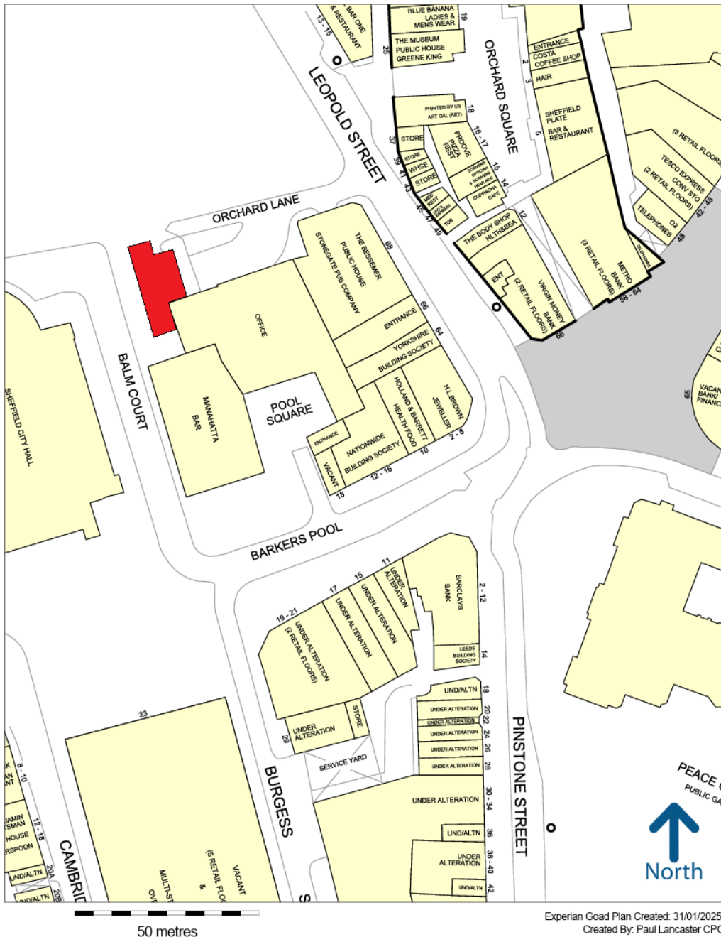
Experian Goad Plan Created: 31/01/2025 Created By: Paul Lancaster CPC